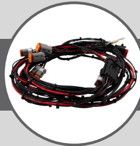
Wire Harness Design & Manufacturing