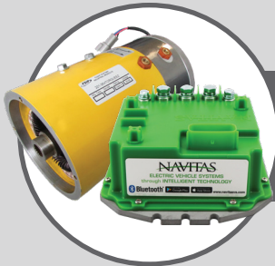
DC Separately Excited Motors & Controllers