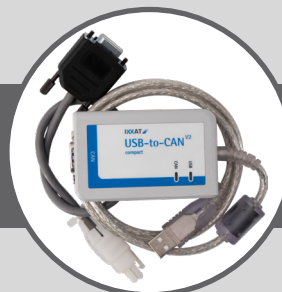
Custom Controller Software