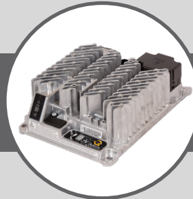
Battery Chargers: On-board & Standalone