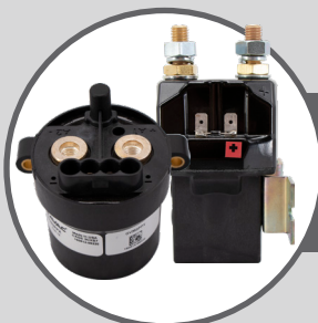
High Current Solenoids & Contactors